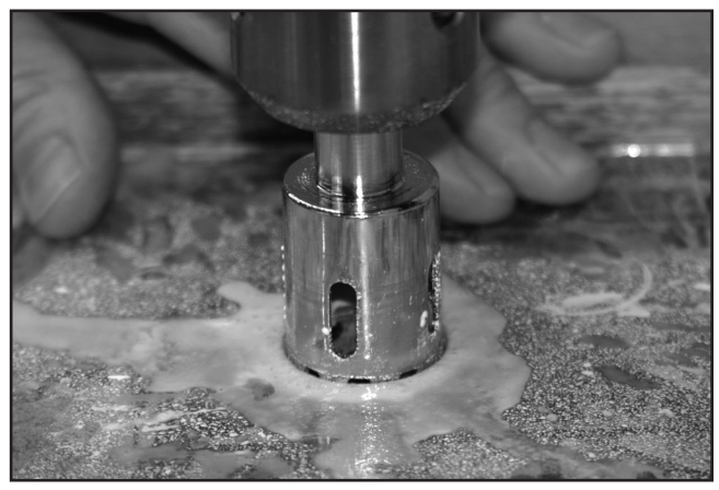
Figure 1. Example of diamond bit drilling hole in glass.

These bits can be used with a handheld drill or drill press. However, we recommend using a drill press whenever possible for greater control and precision (see Figure 1 ).