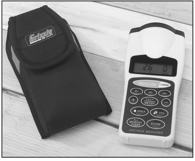
The Model H5844 Range Finder.