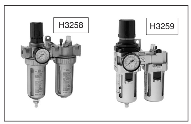
Figure 3. Models H3258 & H3259 Filter/Lubricator/Regulators.

These units are indispensable for prolonging the lifespan of your air tools. Filter keeps water/rust out. Lubricator features adjustable automatic lubrication. Regulator allows you to control the optimum PSI delivery for each air tool. Maximum pressure for each unit is 150 PSI.