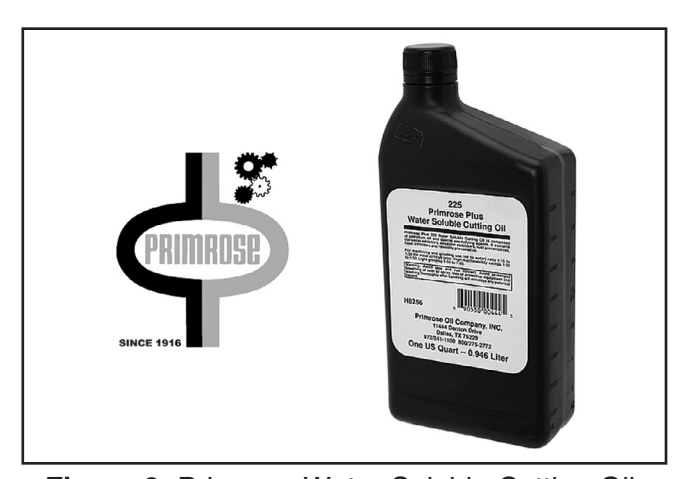
Figure 2. Primrose Water Soluble Cutting Oil.

Increases tool life with superior lubricity, maximum cooling and anti weld properties. No undesirable fumes, smoke or fog. Prevents growth of bacteria in cutting fluid dilutions. Provides a better finish to special alloys, even at higher speeds. Thin film of oil protects metal, yet requires no de-greasing before painting. Eliminates rust in equipment and on finished parts. Simply dilute with water—ratio based on metal machineability, tool set-up, feed and speed.