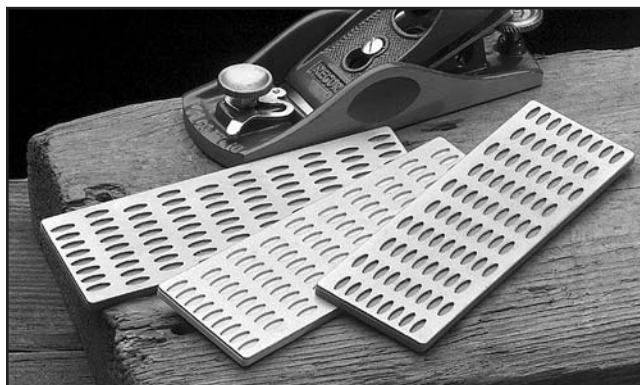
Figure 3. H2927 3-Pc. Diamond Whetstone Set.

Includes extra fine, fine, and coarse grades. Quick, easy and effortless sharpening. No oil lubrication needed. Only requires water. Extremely durable.