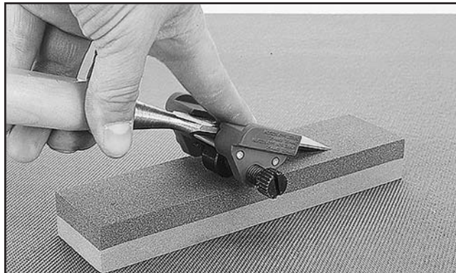
Figure 2. G1482 Honing Guide.

Accurate bevels are easily achieved using this honing guide. Very easy to use and a must for any chisel owner. It can also be used for plane irons up to 2 5 / 8 " wide and chisels up to 1 5 / 8 " wide. If you've tried sharpening blades by hand then you know that this is one tool you must have!