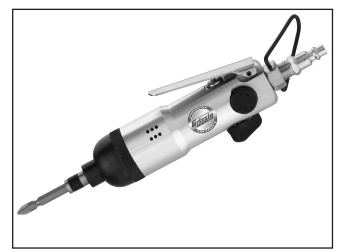
Figure 1. Model H6191.

Screw the <sup>1</sup>/<sub>4</sub>" NPT Air Fitting on the air inlet of the screwdriver. Push the Phillips head driver into the socket to lock in place. Twist the adjustment dial to set the torque to your desired setting.