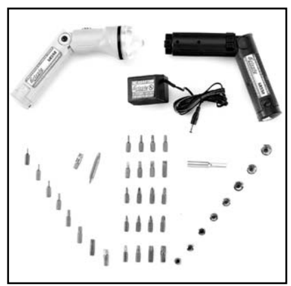
Fig 1. Kit Contents (case not shown).

If any parts are missing, please contact Grizzly's Customer Service department at the phone number provided on the Warranty/Returns page.