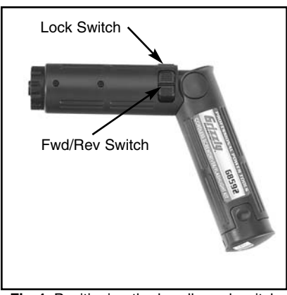
Fig 4. Positioning the handle and switch location.

The driver and flashlight are both jointed in the center to adjust to different types of use. Adjust the angle to whatever is comfortable for the job to be done (See Figure 4.)