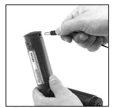
Fig 2. Plugging charger into battery.