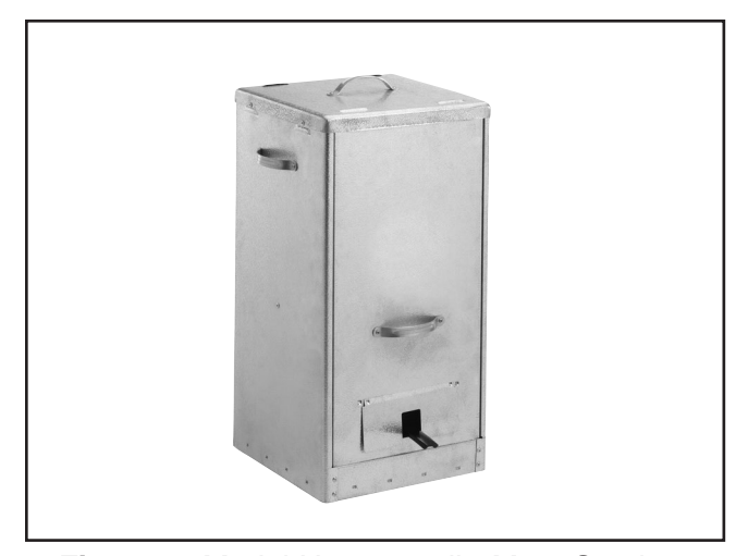
Figure 1. Model H6255 10 lb. Meat Smoker.