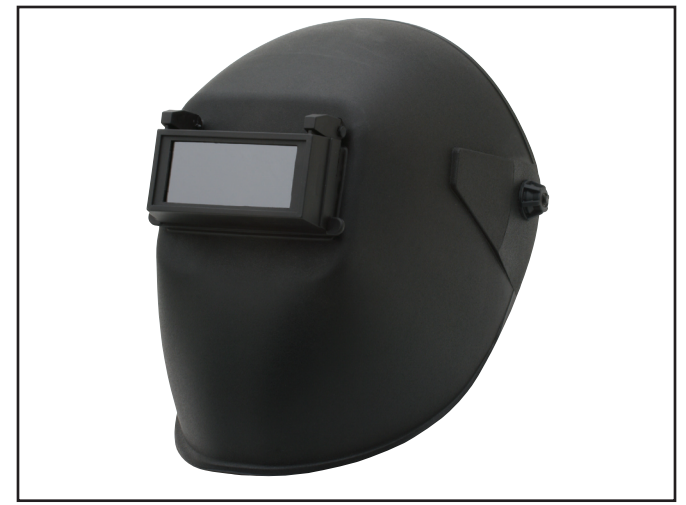
Figure 1. Model H7787.

The headband and middle strap must be properly adjusted before flipping the helmet down by nodding your head. If the headband is too loose, the helmet may tumble off after being flipped down and the lenses could be damaged.