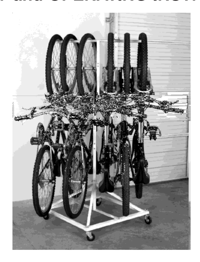
(Bicycle's not included)