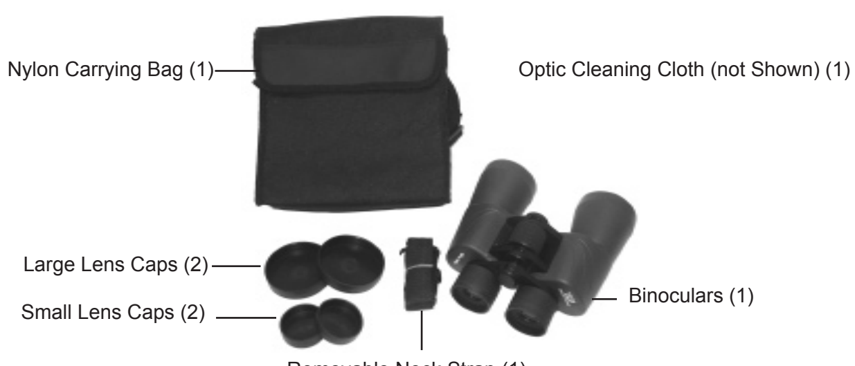
Removable Neck Strap (1)

When unpacking your Binoculars, check to make sure the following items are included. If any items are missing or broken, please call HARBOR FREIGHT TOOLS at 1-800-444-3353 .