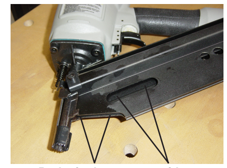
Probe in these areas with a screwdriver to release jammed nails.

If you are unable to clear the nail jam using the method prescribed above, the tool should be taken to a qualified service technician for proper servicing.