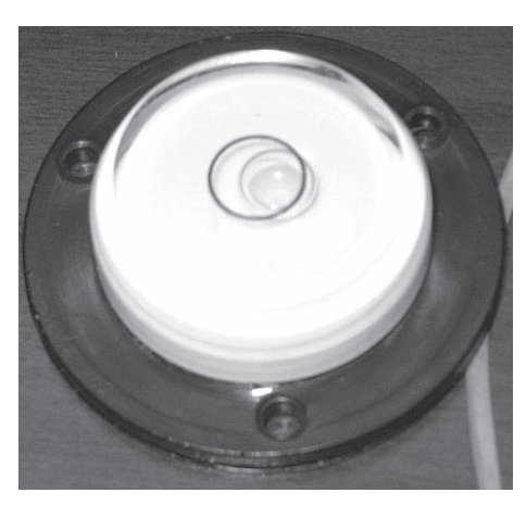
Bubble Level (A)

1. To operate your Wheel Balancer, first ensure that it is properly assembled and level with your floor as discussed above.