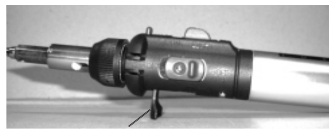
Soldering Iron Stand

The torch comes with a stand that can be pulled out to allow you to rest it on a flat surface. See photo below.