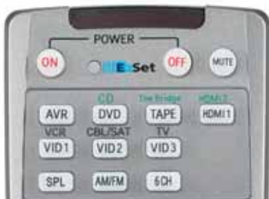
Figure 3 – EzSet (SPL) Button

Point the remote at the receiver. Press and hold the SPL Button until the LED remains steadily lit, then press the "5" key. See Figure 3. The procedure works best if you hold the remote at about ear level, pointed toward the receiver. Try not to tilt the remote out of line with the AVR's front panel.