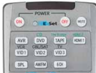
Figure 2 – Input Selectors

d) HDMI 2 Source: Press and release the Input Selector once, then quickly press the Input Selector again so that it turns green, then release it. Now press and hold the Input Selector until the selector relights and the Program Indicator flashes, then release it. Next, press the Input Selector that corresponds to the device type you want to program into the HDMI 2 mode, i.e., DVD, VCR or CBL/SAT. Then follow the directions in Step 4.