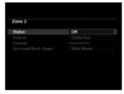
Figure 38 – Zone 2 Menu

The AVR 460/AVR 360's multizone system is accessed using the on-screen Zone 2 menu. Press the Setup Button, and use the ▲ ▼ Buttons to navigate to the Zone 2 line. Press the OK Button to display the Zone 2 menu. See Figure 38.