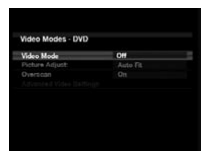
Figure 35 – Video Modes Menu

NOTE : The settings in the Video Modes menu affect each source independently.