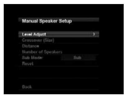
Figure 30 - Manual Speaker Setup Menu

If you have run the EzSet/EQ process, the results were saved. To tweak the EzSet/EQ results, or to configure the AVR 460/AVR 360 from scratch, select Manual Setup. A screen similar to the one shown in Figure 30 will appear.