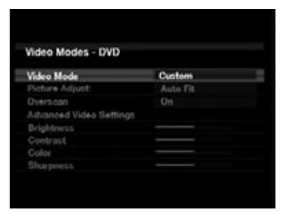
Figure 37 – Video Modes Custom Processing

Set the Video Mode to Custom to display the picture settings, as shown in Figure 37.