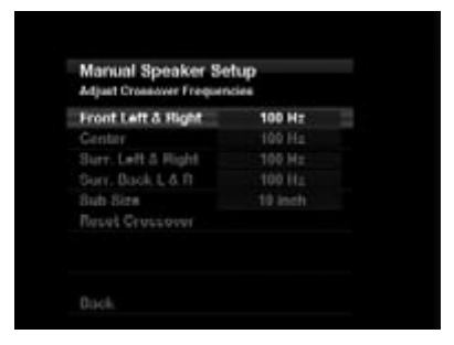
Figure 32 – Adjust Crossover Frequencies Menu

After you have programmed the number of speakers, the AVR will return to the Manual Speaker Setup menu (see Figure 30). Navigate to the Crossover (Size) line and press the OK Button to display the Adjust Crossover Frequencies menu (see Figure 32).