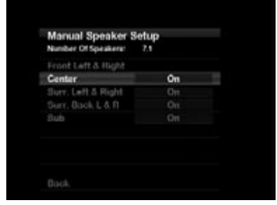
Figure 31 – Number of Speakers Menu

Move the cursor to the Number of Speakers line and press the OK Button. See Figure 31.