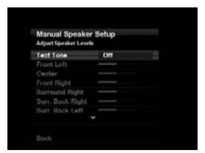
Figure 34 — Adjust Speaker Levels Menu

Press the Setup Button to display the menu system, and then navigate to the Speaker Setup line. Press the OK Button to display the Speaker Setup menu. Select Manual Setup, press the OK Button, and then navigate to the Level Adjust line. Press the OK Button to display the Adjust Speaker Levels menu. See Figure 34.