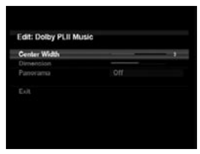
Figure 29 - Dolby Pro Logic II/IIx Music Mode Settings

Some additional settings are available for Dolby modes. When the Dolby Pro Logic II or IIx Music modes have been selected, choose the Edit submenu to adjust the Center Width, Dimension and Panorama settings. See Figure 29.