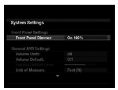
Figure\ 39-Systems\ Settings\ Screen

The AVR 460/AVR 360 offers system settings for ease of use. These settings may be accessed from the System Settings menu, which is selected by pressing the Setup Button and navigating to the System line. Press the OK Button to display the System Settings menu. See Figure 39.