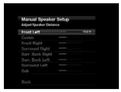
Figure 33 – Adjust Speaker Distance Menu

On the Manual Speaker Setup menu, move the cursor to the Distance line and press the OK Button to display the Adjust Speaker Distance menu. See Figure 33.