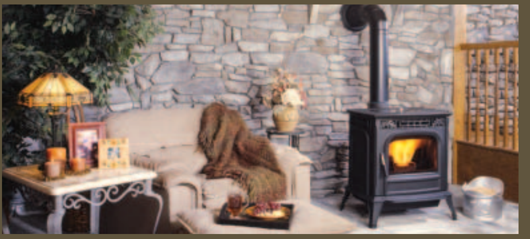
The Harman XXV shown using optional Top Vent Adapter with 6"pipe.