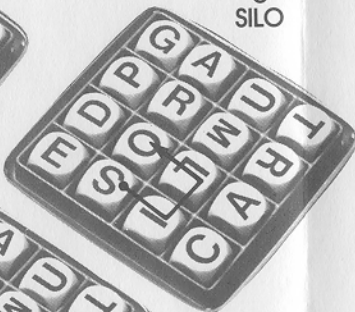
Figure 2 SILO