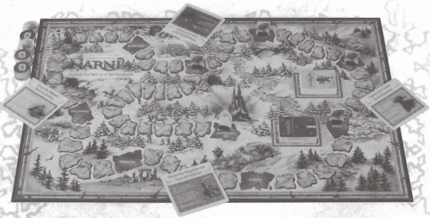
Figure 1: This example shows the setup for a 4-player game.