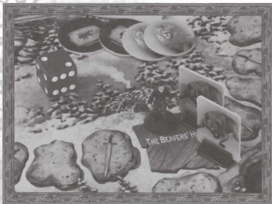
Figure 2: In this example, Edmund has rolled a "2". He moves his pawn 2 spaces and lands on 2 wolves. This costs Edmund 4 Aslan tokens!

Aslan's Hint: All players have SPECIAL ABILITIES, which may be used once per turn. Some Special Abilities may be used on your turn; others can be used on an opponent's turn. Always be sure to know what your Special Abilities are. For example, you may be able to re-roll the die or choose another card!