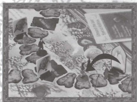
Figure 3A This example shows the movement of the White Witch when all players are on the same space as her or BEHIND her.

If the White Witch moves onto a space occupied by a character, that character is immediately TURNED TO STONE (see page 6.)