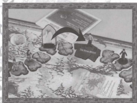
Figure 3B This example shows the movement of the White Witch when players are both IN FRONT of and BEHIND her.

Aslan's Rule: You must always STOP at an Event space and draw a card—even if you have moves left on your roll.