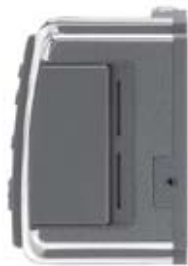
CFV II digital capture unit

No 'Exposure' cable required (except for long exposures)