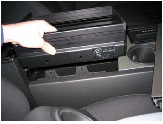
Position console so holes in side of console align w/ holes in factory console