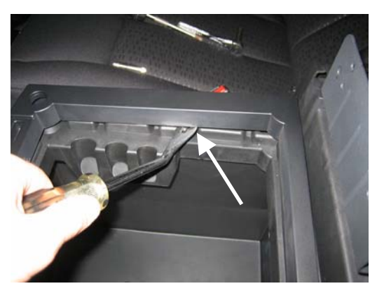
Pry up on accessory pocket trim panel and remove