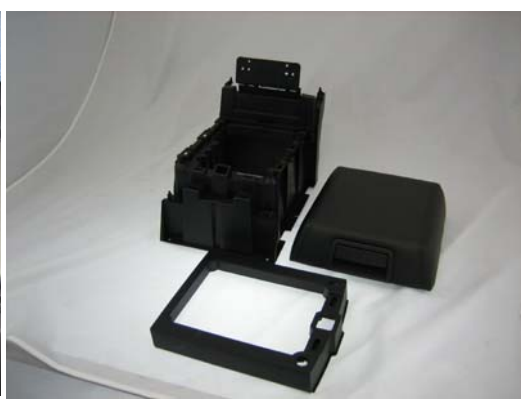
Parts removed from OEM console