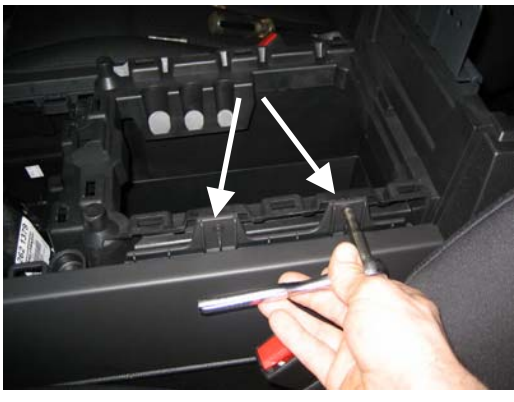
Remove hex head screws holding side of accessory pocket