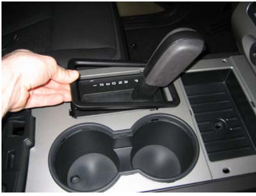
Replace the trim panel around gear shifter