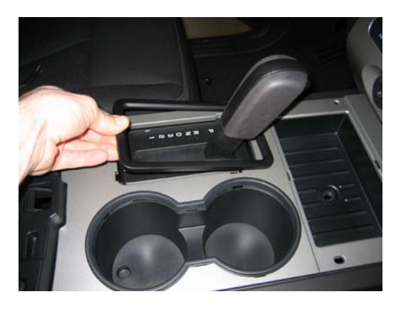
CAREFULLY remove trim from around gear shifter