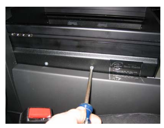
Install #10 x ½" machine screws and keps nuts as shown above