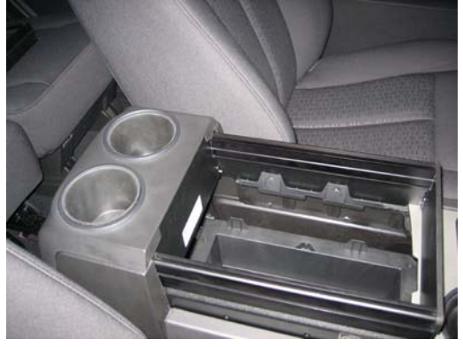
View of console installed