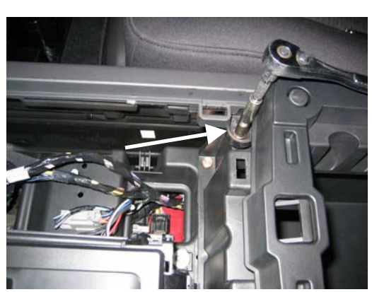
Remove hex head screw from accessory pocket/armrest