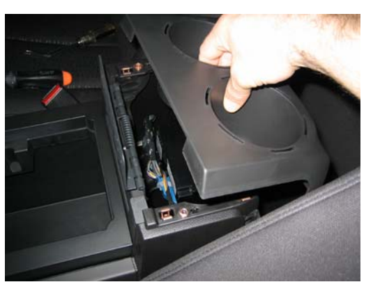
Remove the rear OEM cup holder