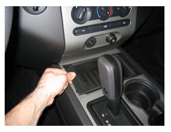
Remove accessory pocket liner as shown above