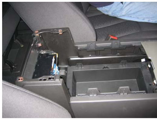
Completely remove the container of the accessory pocket