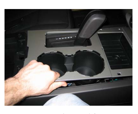
Remove trim panel from console.