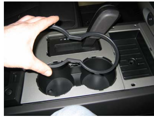
Remove trim from around the cup holders