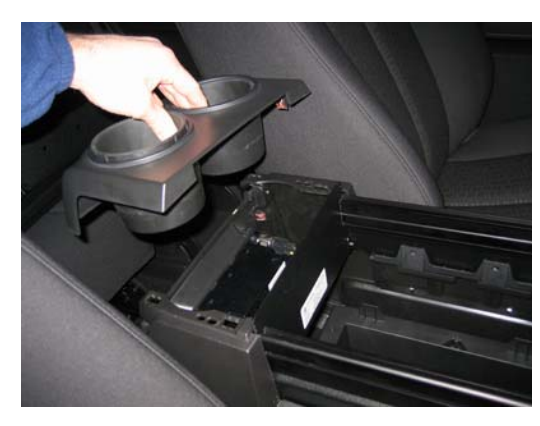
Replace rear cup holders