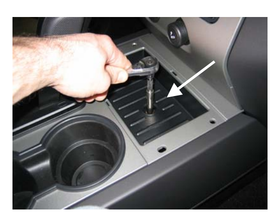
Replace hex head screw on accessory pocket