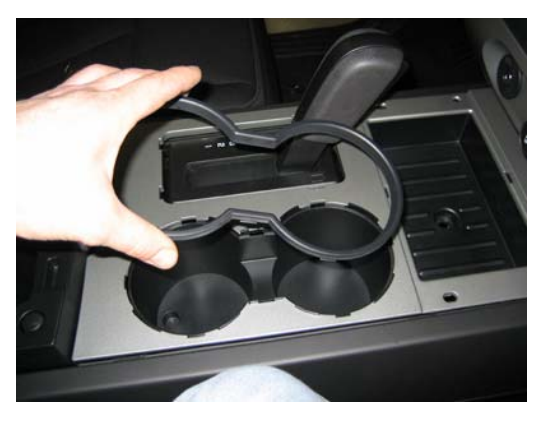
Replace trim panel around factory cup holder