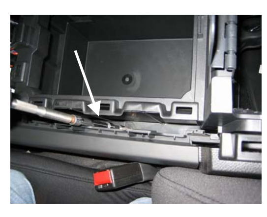
Remove hex head screws holding lower sides accessory pocket