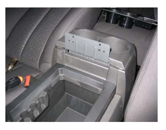
Remove (4) hex screws holding armrest pad from hinge