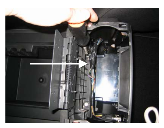
Remove hex head screws holding rear of accessory pocket