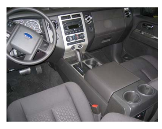
View of vehicle w/ full console & console shifter