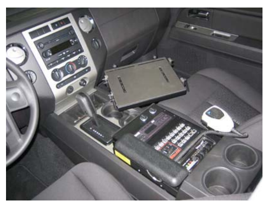
View of specific application including C-TCB-24, C-ARM-2, C-3090-7, control heads, etc..(Sold Seperatly)

Consolidator® • Kwik-Raze® • Collins Dynamics® • Kwik-Kit™ PrisonerTransports • K-9Transports