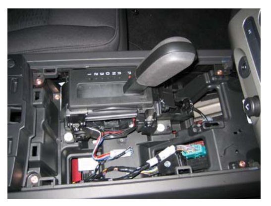
View of panel removed