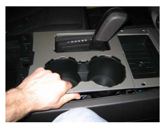
Replace the trim panel previously removed earlier