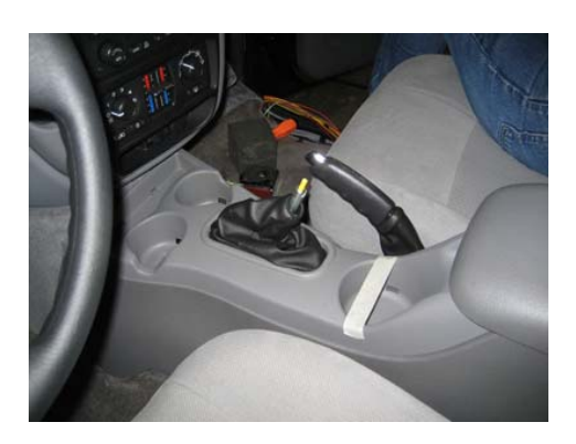
Mark Measurement with tape.