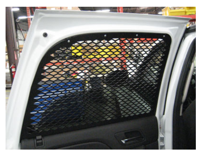
Hinge up window guard and attach to top bracket with 10/32 x \frac{1}{2} machine screws

Hold top bracket in its location, mark the four mount holes and drill with 1/8" drill bit. Carefully hold rubber gasket away from drill. Drill 1/8" holes for hinge mounting. Attach Top bracket and hinge with #10 x \frac{1}{2} " sheet metal screws.