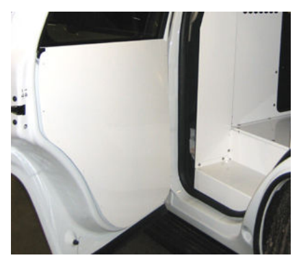
Center door panel on door. Push down and drill mount holes with 1/8" bit. Attach with #10 x <sup>3</sup>/<sub>4</sub>" Sheet metal screws