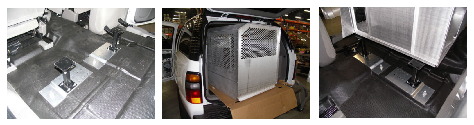
Slide in Main K9 Housing and rest on mounting feet.