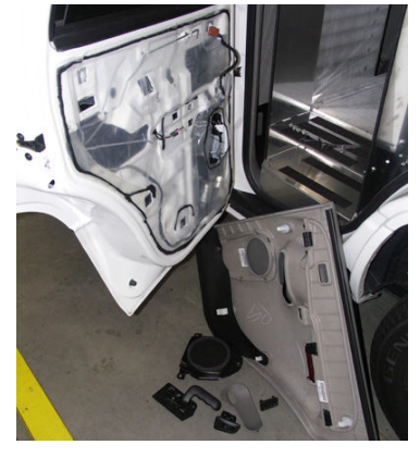
Remove passenger door panels, door handles and speakers Note: Reconnect window switches and wire tie parts so they do NOT interfere with window operation. Note: Wrap OEM switch with Plastic bag to protect from water KK-K9-C20-K-PT_INST_10-07

Leave the single passenger-side seat installed