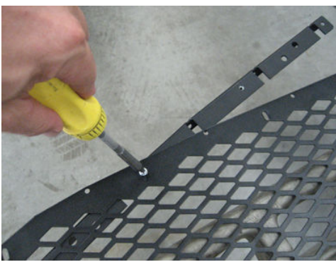
Remove top bracket from window guard