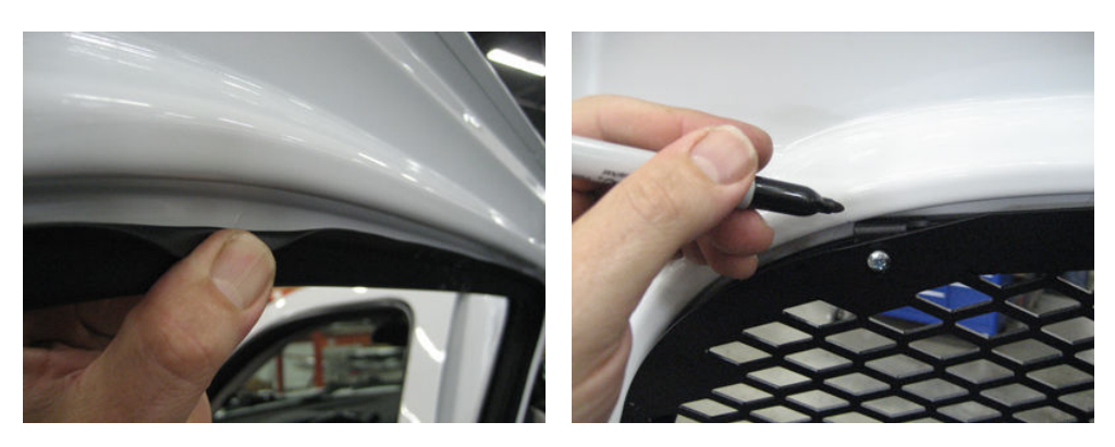
With door panel installed, hold up window guard assembly with top bracket between rubber and metal frame. Guard hinge will sit on top of door panel. Mark location of top bracket and hinge.