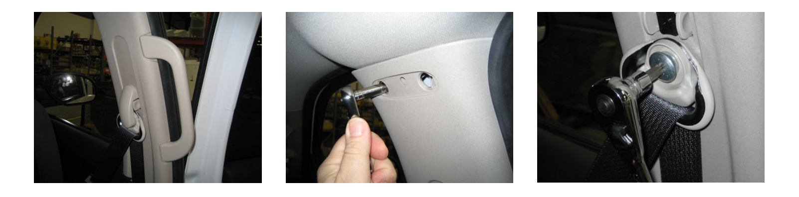
Remove "B" Pillar Trim, Seat belt bolt and Grab Handle