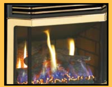
Shown with optional gold door crown and gold rod grille

The TrueGlow Burner, an exclusive from Quadra-Fire, sets a new standard for realism. The ceramic burner is molded from real wood pieces and coals. Flames rise from gas ports distributed throughout the glowing coal bed and lower logs, producing an incredibly active and varied fire. No need to hide the burner anymore—the TrueGlow burner proudly takes center stage, with an appearance that is phenomenal, whether it's burning or not.