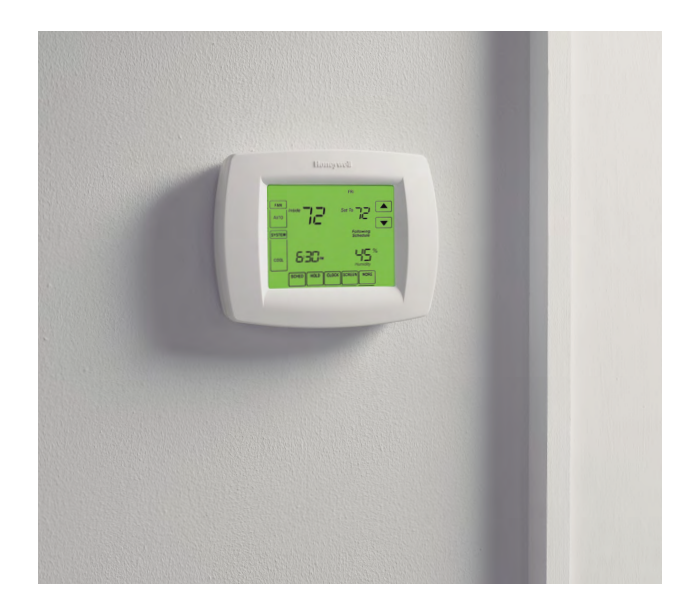
A thermostat and more. One control for all of your home comfort solutions.