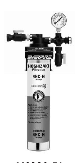
H9320-5 I Single Configuration Shown