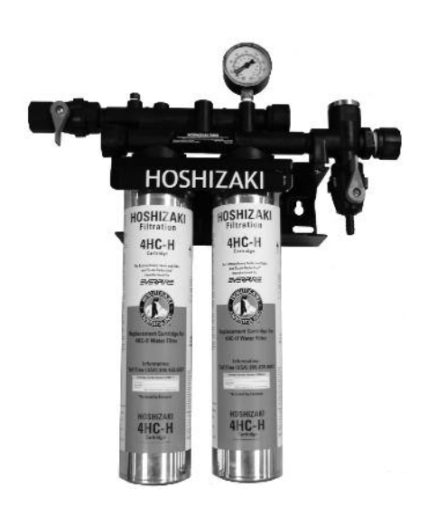
H9320-52 Twin Configuration Shown

*Available in single, twin, and triple configurations