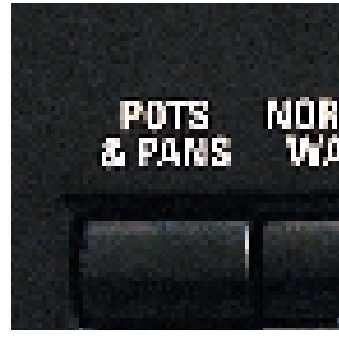
Pots & Pans cycle Removes dried-on and baked-on (but not burned-on) food from pots, pans and dishes.