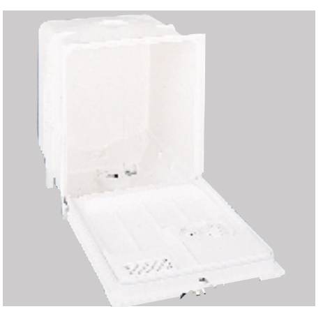
Durable tub and door liner Guaranteed against leakage from cracking, peeling, chipping or rusting for ten years.*

Not all features available on all models * See warranty for details.