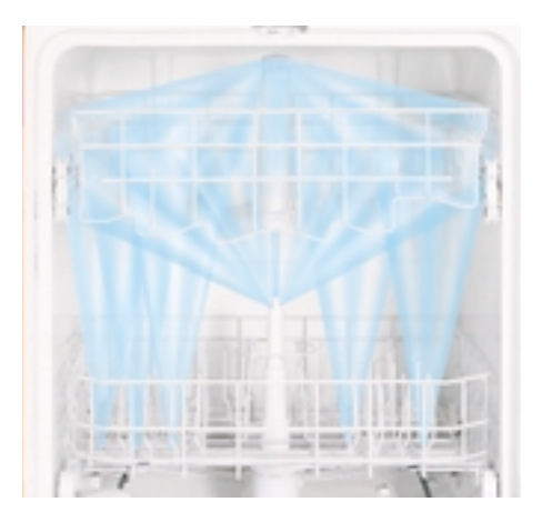
New Power Wash II System Three-level wash action with powerful jet action for effective food soil removal and great wash performance.