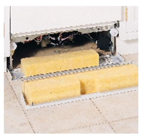
Toe kick & access panel insulation Fiberglass insulation in toe kick and access panel minimizes operating noise.