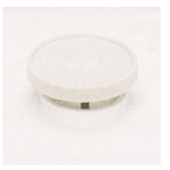
Crystal Clear™ rinse aid dispenser Container automatically releases a small amount of rinse agent, which speeds drying and lessens water spotting and streaking.