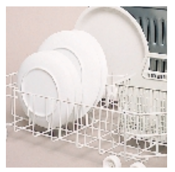
Deluxe lower rack The rack has curved tines to accommodate stoneware and large plates or broiler pans.

Not all features available on all models.