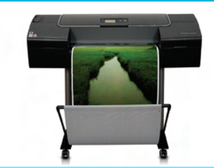
HP Designjet Z2100 610 mm Photo Printer (Q6675A)