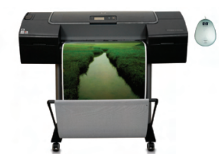
HP Designjet Z2100 GP 610 mm Photo Printer (Q6675B)

Base 610 mm model plus HP Advanced Profiling Solution Q6695A included in the box