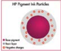
Electrostatic Encapsulation Technology

HP Vivera pigment inks offer outstanding image quality and fade resistance on a wide variety of photo and fine art media, along with water resistance on a range of HP creative and specialty media. HP's proprietary Electrostatic Encapsulation Technology optimizes the pigment chemistry and ink properties for stability and performance to ensure a broad color gamut, print permanence, excellent gloss uniformity and reliable, accurate and consistent printing.