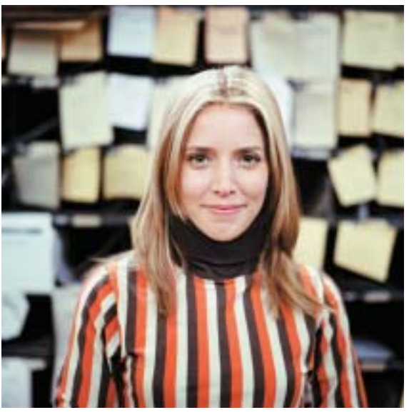
HP papers and films