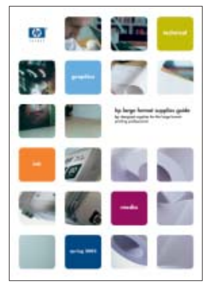
Download from Www.Somanuals.com. All Manuals Search And Download.

If you'd like to receive the information-packed Large Format Supplies Guide, simply register at www.designjet.hp.com/supplies