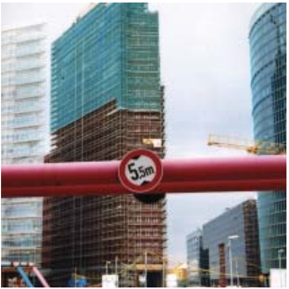
HP Large Format Printing Materials