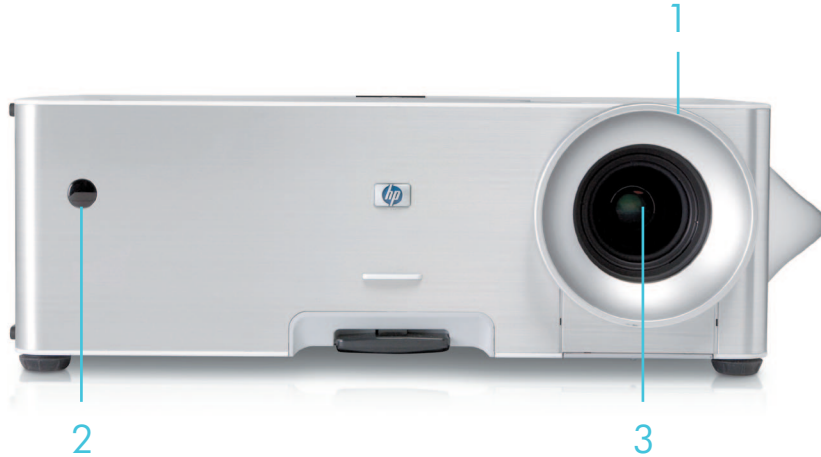
HP Digital Projector xp8010 shown