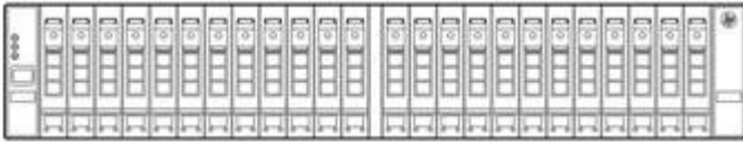
HP 3PAR StoreServ 7200 Storage

HP 3PAR StoreServ 7000 is storage made effortless.