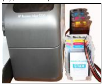
Put the CISS on the left side of the printer, in the same time order all the tubes in the correct position