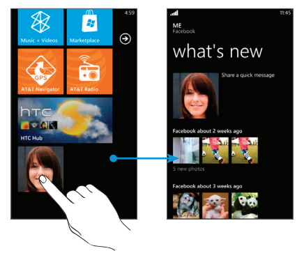
Tap Share a quick message to update your status.

Tap your Me tile on the Start screen (or in all of the People hub) and check status updates you have posted, comments you have received, and pics that you have uploaded to your Windows Live and/or Facebook accounts