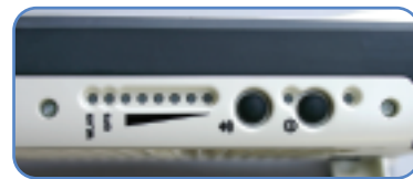
Front view, close-up