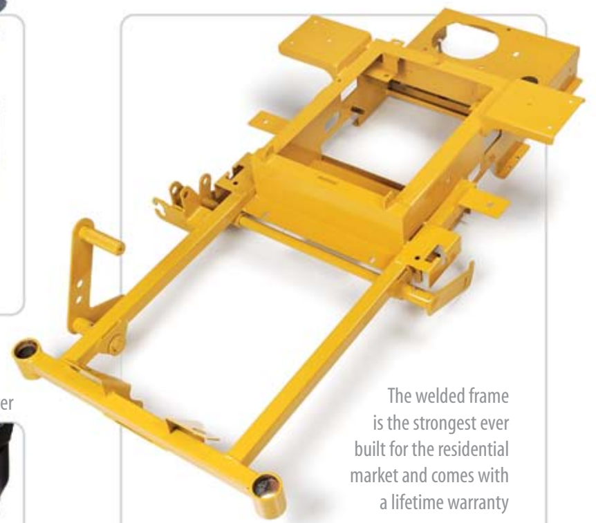
The welded frame is the strongest ever built for the residential market and comes with a lifetime warranty

Honda or Kohler engines provide plenty of high-torque power