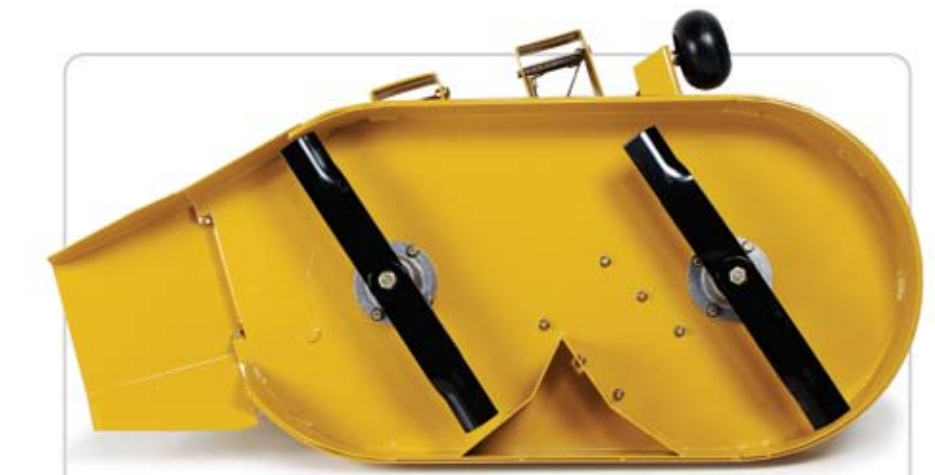
Heavy-duty welded decks come with a lifetime warranty on the leading edge