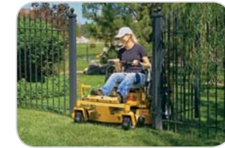
With the compact Mini Z, gates are no longer an obstacle to your riding mower.