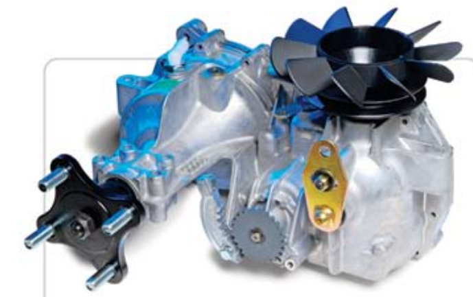
The maintenance-free EZT transmissions are the heart and soul of the Mini FasTrak's SmoothTrak™ steering