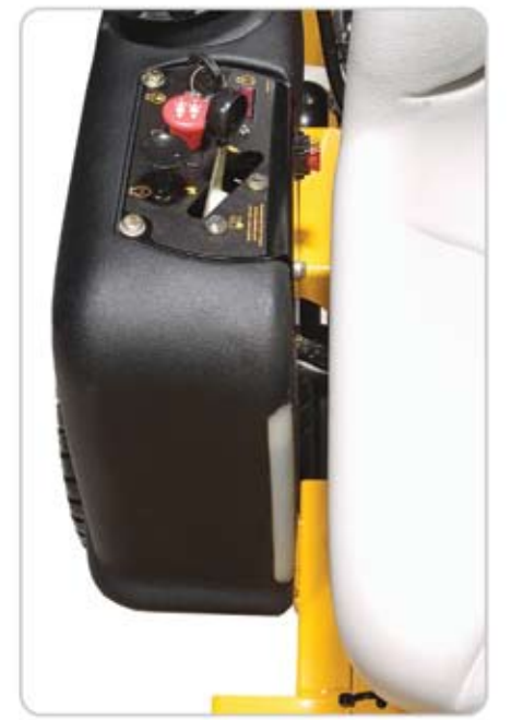
The fuel tanks come with an integrated site gauge allowing you to check your fuel level at a glance