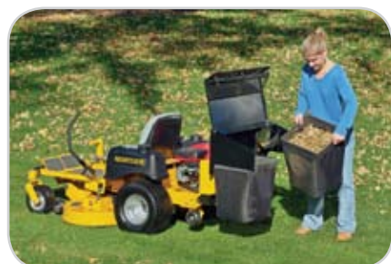
Optional catchers help the FasTrak and Mini FasTrak maintain a professional quality lawn.

Own the Hustler Mini FasTrak. And let the neighbors pretend not to notice.