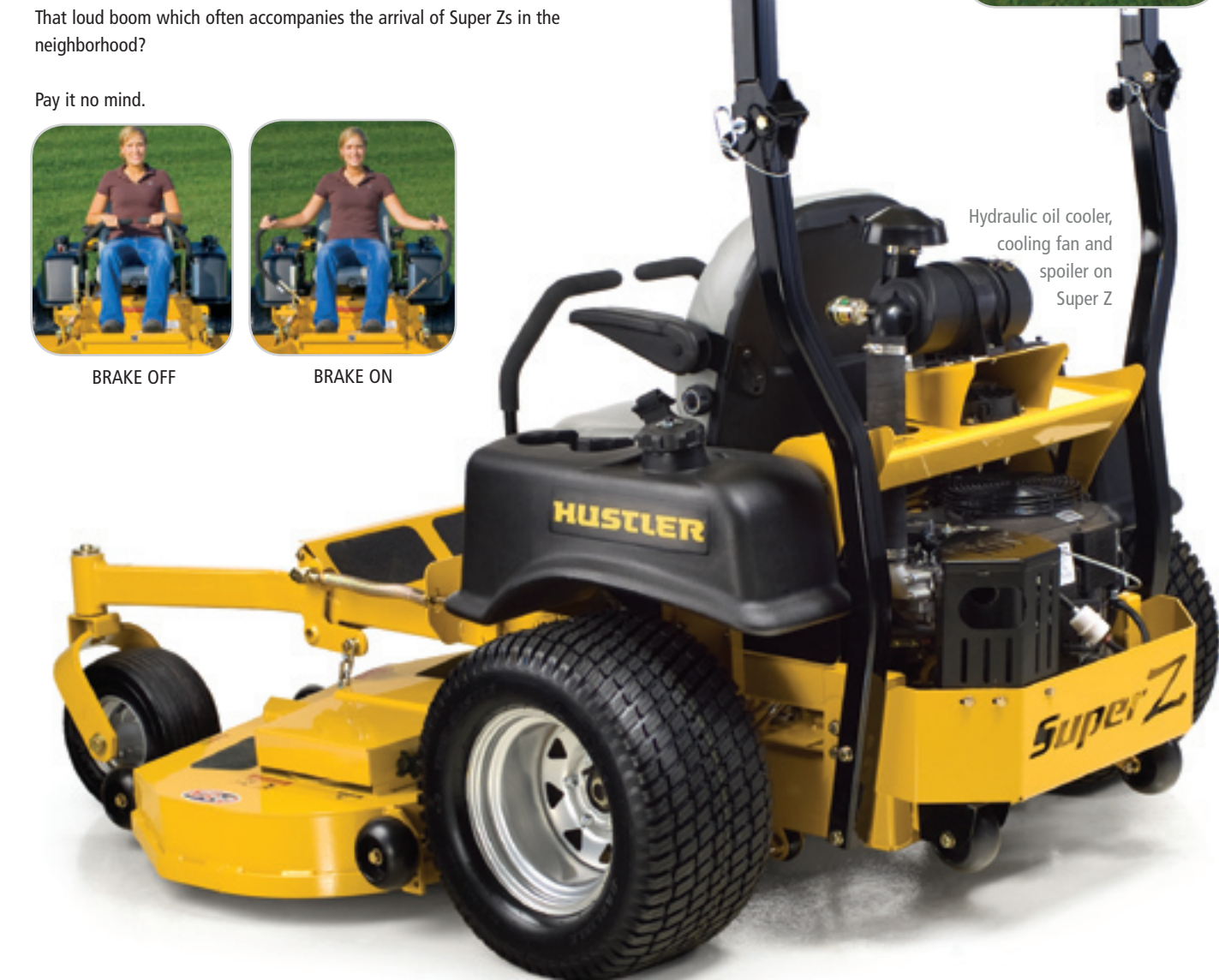
Hydraulic oil cooler, cooling fan and spoiler on Super Z