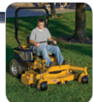
The XR-7™ Deck with attached mulching kit for flawless dual side trimming.

Everything about the Hustler Zs have been designed for trouble-free long-term performance. The Hustler Zs are simply the strongest, most ruggedly durable midmount riders ever built.