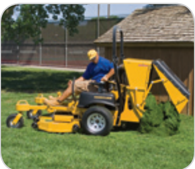
The 9-bushel BAC-VAC™ fiberglass catcher empties from the driver's seat and features a flow-through venting system

Demo a Super Z or Hustler Z today. Waiting for you will be the most durable, most productive, most feature-rich Z-rider on the market. At one of the industry's lowest purchase prices among 60-inch-deck models – legendary Hustler performance and reliability at a very affordable price.