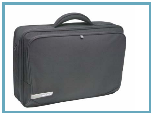
TAN3108HY Top loader