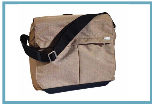
TAR3501 Messenger (zipped)