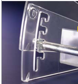
■ Five possible height settings