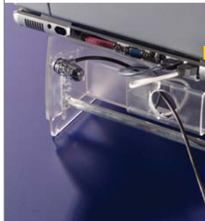
■ Ultra-portable; includes own carrying case