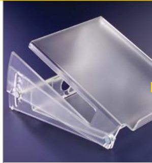
■ Integral document holder

Recent studies in Sweden and the Netherlands show that working with the Ergo-Q results in significant improved body posture, more comfort, less musculoskeletal pain and injuries and higher productivity.